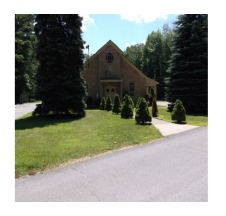
122 Shiny Mtn. Rd.