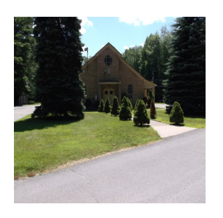
122 Shiny Mtn. Rd.